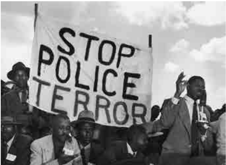
A “communist” meeting in Johannesburg, 1950, as reported by American Life magazine photographer. This photographic documentary exposed an international readership to the newly formalised system of Apartheid.

In 1941, a new union federation called the Council of Non-European Trade Unions (CNETU) was formed. In the same year, the African Mine Workers Union (AMWU) was also formed. The government began to talk about reforms, even getting rid of the pass laws. Then, at the end of 1942 and 1943, workers built the biggest strike wave there had ever been in the history of South Africa. In 1943 there was a bus boycott in Alexandra township and in 1944 there was a massive struggle of squatters for land and houses in the urban areas near Johannesburg.