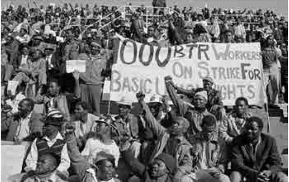
BTR workers on strike for basic union rights, Durban 1973.

The first big sign that workers were once again ready to struggle came when 60,000 workers in Durban, Pietermaritzburg and parts of Johannesburg went on strike for higher wages. The strikes in 1973 were the beginning of a new determination of workers to struggle. An international crisis in capitalism saw bosses profits drop everywhere. And when bosses profits drop, the burden is always passed on to workers. For years and years workers in South Africa had laboured for low wages. But in the early 1970s price increases pushed the value of workers' wages even lower. Workers were confident once again to express their anger. This was the time when workers came out of the darkness of the 1960's and began to build their movement of struggle once again.