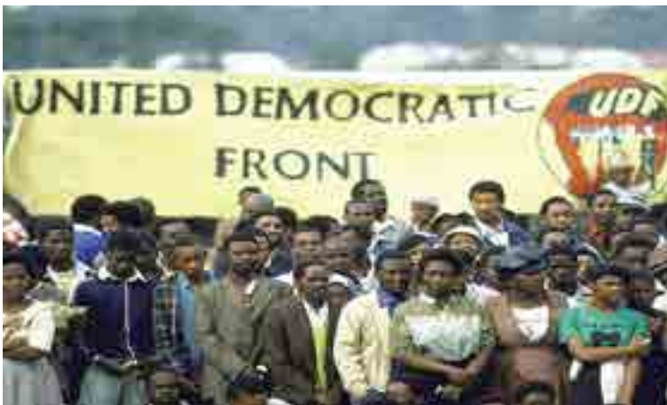
Mourners carry a United Democratic Front banner during a mass funeral for 18 people killed during unrest in Duncan Village near East London.

Most unions decided not to affiliate to the UDF, in order to safeguard their independence. A handful of unions, like the South African Allied Workers Union, did join the UDF. Nonetheless, a relatively close relationship developed between the UDF and FOSATU, although it was often strained by political and strategic differences. FOSATU threw its weight behind the Tricameral Parliament boycott campaign.