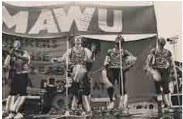
Abafana bo moya performing at the Metal Allied Workers Union annual general meeting, Curries Fountain, Durban November 1986.