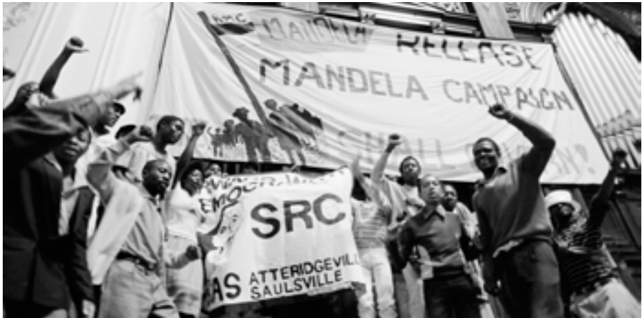
UDF rally in Johannesburg, 19 August 1984.

Eventually the mounting struggles in the townships, especially their occupation by security forces, pushed the unions in the direction of greater involvement in township politics. The establishment of community-based shop steward councils on the East Rand was a further indication of the growing links between factories and communities. Students also regularly asked unions for co-operation. They became the critical point of connection between workers and the community, particularly in 1984.