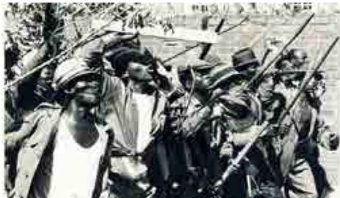
Workers at the Coronation Brick and Tile factory, Durban, sparked a wave of strikes, including these municipal workers. By February 1973, 30,000 South African workers were on strike demanding increased wages and better working conditions.

Workers rebuilt unions in different ways. Some joined industry-based unions like MAWU, NUTW, CWIU, CCAWUSA and SFAWU. Others joined the general unions like SAAWU and GAWU. Different approaches to organising workers also carried different politics. Many union activists carried with them the SACTU tradition of political unionism. They brought an important pressure on the newly emerging union organisations to develop links beyond the factory floor. Others, critical of this approach and keeping their distance from politics, emphasised the importance of building strong workplace structures that could withstand state repression. They stressed the importance of building democratic worker control of the trade unions, of building shop steward structures in the factories, and fighting for recognition from employers.