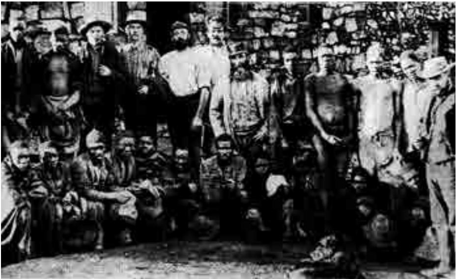
The racism of minework reserved better wages and positions of authority for Whites. The profitability of mines depended on cheap Black labour, and keeping it that way.

South Africa's valuable mineral resources attracted foreign capital and large-scale immigration. Discoveries of these valuable minerals and their abundance were much more than in anywhere else in the world at the time. Due to this, more foreign capital got invested in South Africa than the whole of the rest of the continent combined. But diamond, and especially gold mining in South Africa, required lots of expensive machinery and an abundance of labour in order to extract it from the ground.