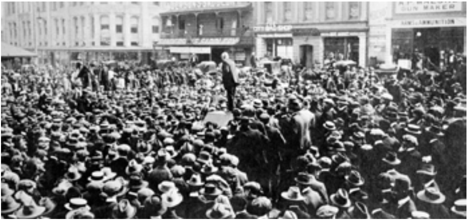
White workers rally in support of arrested leaders of the 'Rand Rebellion', 1922.

At that time, it was not just the organisation of workers that was young. Industry in South Africa was also young. As capitalist industry developed, the power and wealth of the bosses grew. But the same process saw the size and strength of the working class grow as well. And inside the working class, the number of black workers, and their importance for capitalist production, also increased.