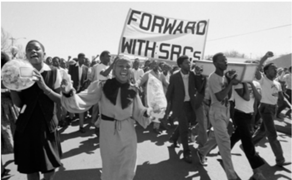
Students marching to a cemetery with grave flowers, Wattville, present-day Gauteng, September 1984.

The regional insurrection started in the Vaal townships in response to the Lekoa Town Council's announcement of a rent increase of R5.90 despite overwhelming evidence that residents could not even afford the existing rents. The Vaal Civic Association led the protests against the Town Council throughout August. On September 2 it was decided that residents should refuse to pay their rents. The stayaway the following day was supported by up to 60% of the workforce. The police reacted viciously to the demonstrations in the townships that day. Scores were injured, and 31 were killed. The fires of resistance quickly engulfed other townships in the PWV. In Soweto, the Release Mandela Committee called for a stayaway in solidarity with Vaal residents. The action was not well organised, however, and only 30-65% of workers heeded the call.